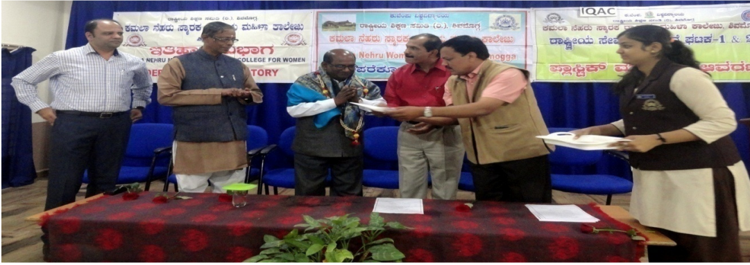
D.Devaraj Urs birthday Celebration