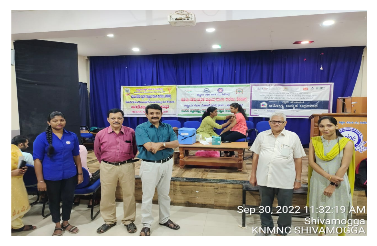
AYUSHMAN BHARAT PROGRAMME